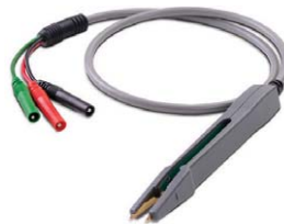
U1782A SMD tweezer