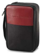
U1174A Soft carrying case