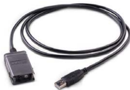
U5481A IR-to-USB cable