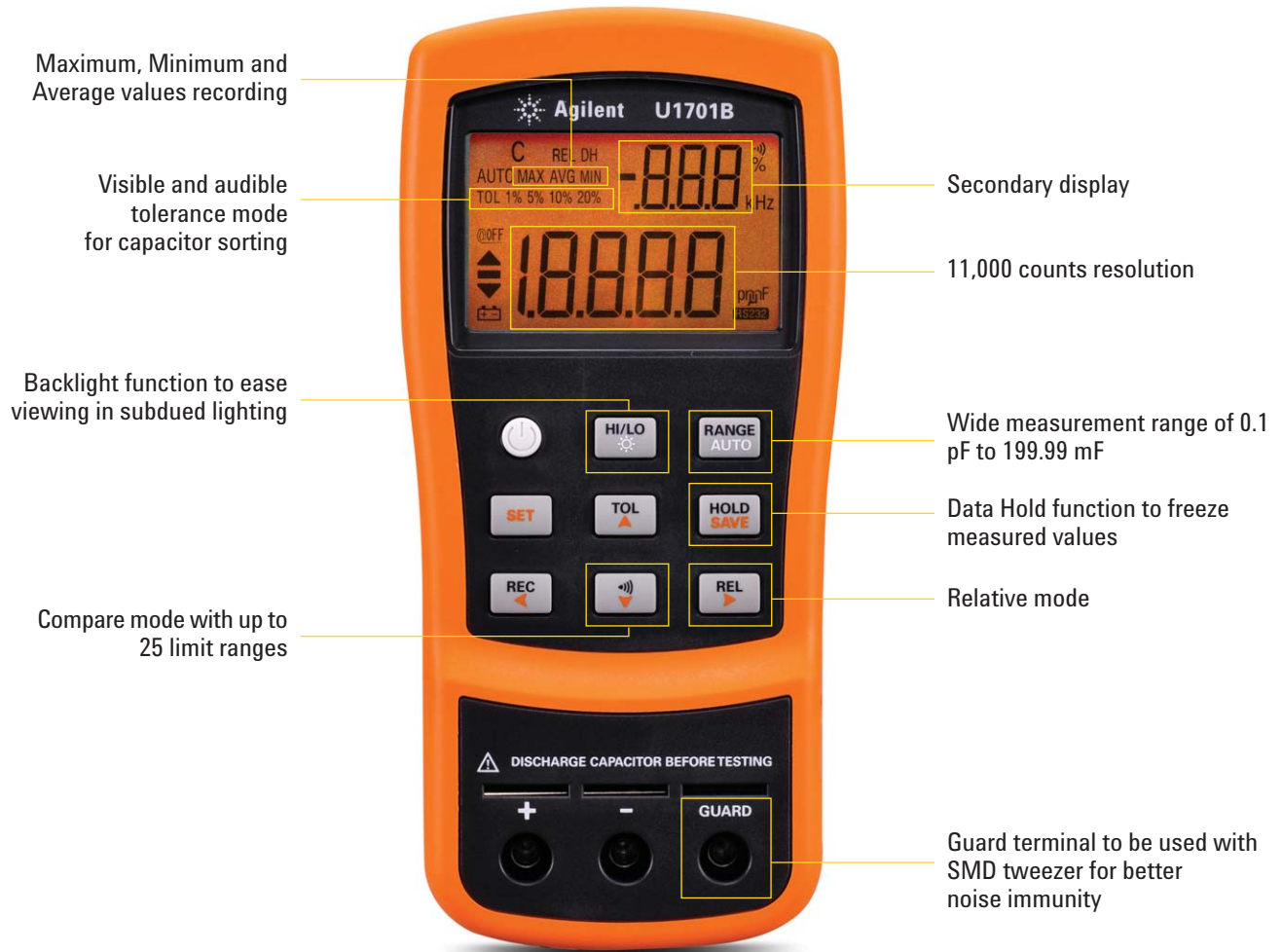
Figure 2: U1701B front view