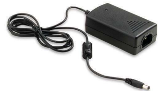
U1780A Power adapter and cord (according to country)