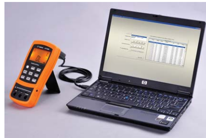
Figure 1: Automate the recording of continuous readings when you hook the U1701A/U1701B to a PC

The handheld capacitance meter comes in a robust overmold and tested to stringent industrial standards. Each capacitance meter is also sealed with a three-year warranty and the assurance that you can test your components with confidence.